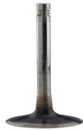
Clean intake valve