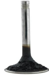
Intake valve with carbon build up.